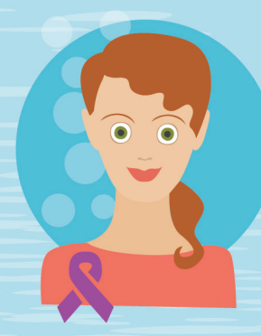
People with weak immune systems