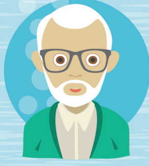
Older adults over the age of 65 years